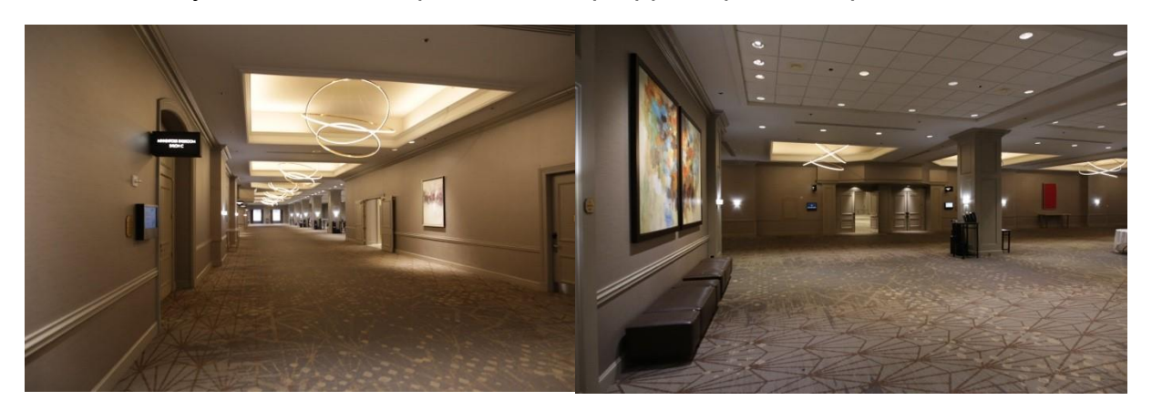
Image descriptions: Photo on the left shows the Prefunction area from the farthest end from the check-in table. The flooring is smooth, carpeted flooring and there is decorative lighting running down the length of the hallway. Photo on the right shows another section of the Prefunction area near one of the entrances to the Ballroom. This part of the hallway is wider and there is decorative art on the wall and some benches for seating.

Lighting in this area does not include any fluorescents and natural lighting is limited to a few windows near the check-in table, though shades can be drawn to limit how much natural light comes in. Any doors to other spaces will be propped open, except for the restrooms.