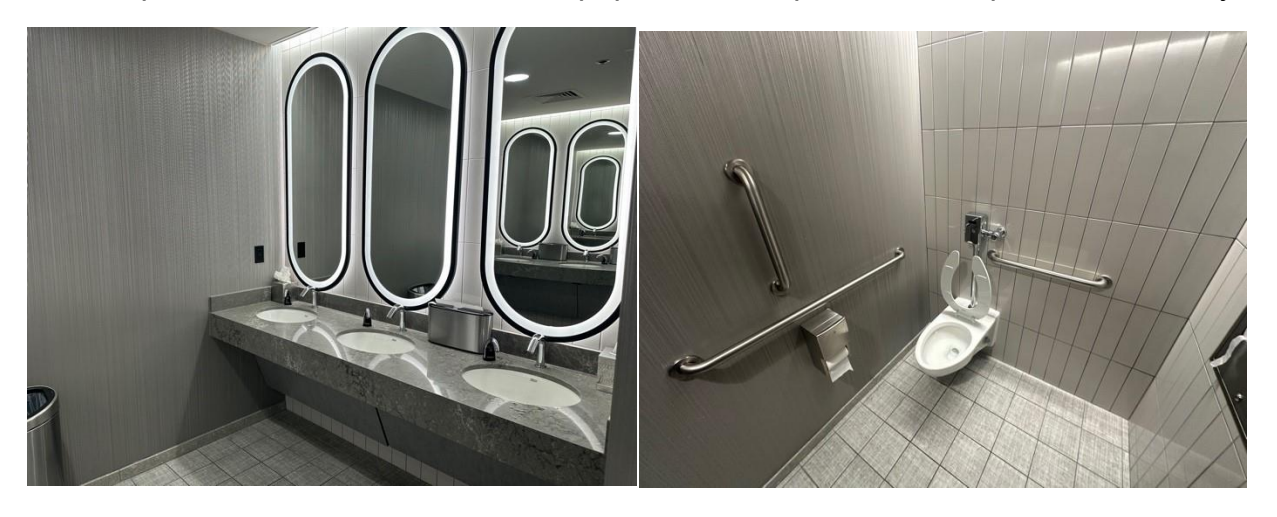
Image descriptions: Photo on the left shows a row of sinks inside a brightly lit restroom. Above each sink is a large, oval mirror that has a bright light shining out of it. The image on the right shows one of the wheelchair accessible stalls in the restrooms. The flooring is gray tile and there are grab bars behind and to the right side of the toilet.

The bathrooms are brightly lit and feature gray tile flooring. There is additional bright lighting that is incorporated within the mirrors. The restrooms have wheelchair accessible stalls, the faucet operates without touch, and the paper towel dispensers are operated manually.