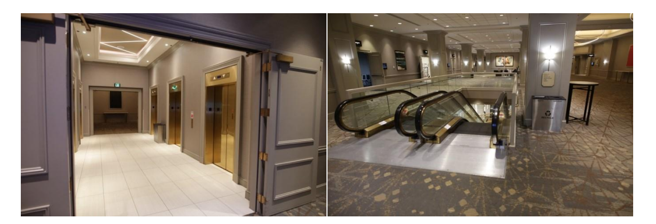
Image descriptions: Photo on the left shows the elevator waiting area that is located in the Prefunction space. There are three golden elevators on either side of the waiting area and the flooring is white tile. The area is brighter than other areas of the Prefunction. The photo on the right shows the top of the escalators that lead to the Prefunction area on the third floor. There is one escalator going up and one going down. The floor immediately at the top of the escalators is metal before transitioning to smooth carpeting.